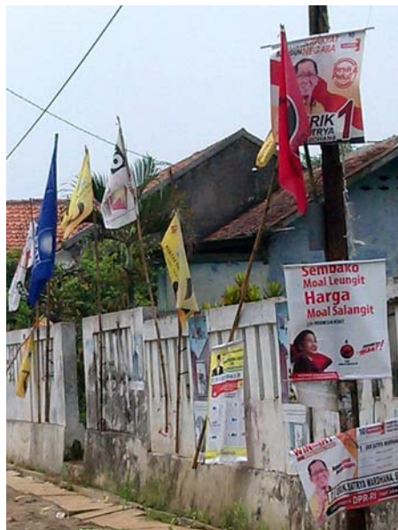
Election campaign flags and posters adorn a wall in Bogor

In last year's fires in Sumatra, especially Riau, fires hotspots were mostly located in timber plantation concessions belonging to the giant pulp and paper conglomerates APP and APRIL. 5 Oil palm plantations are frequently the site of fires too: Riau also hosts Indonesia's most extensive oil palm plantations amounting to 3 million hectares of Indonesia's total 13 million hectares of oil palm plantations. 6