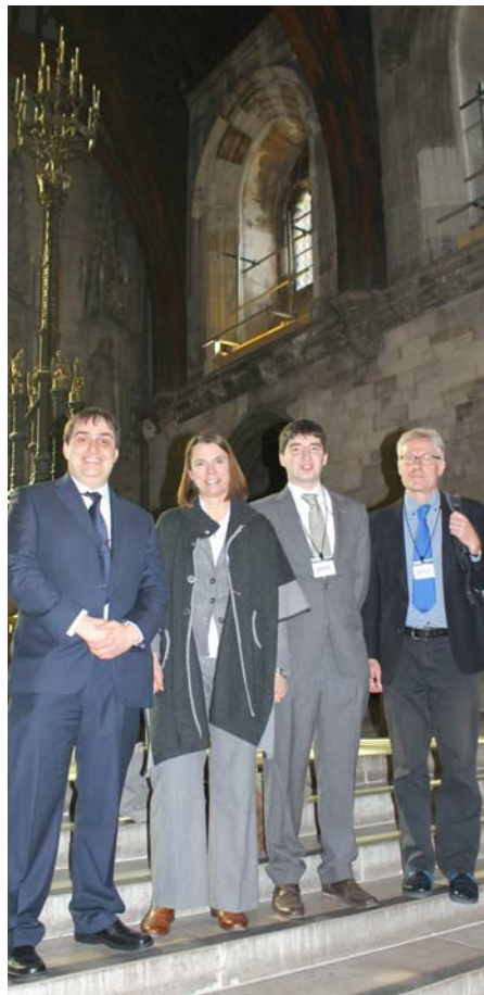
Submitting evidence: representatives from WDM, WWF-UK, Christian Aid and London Mining Network (LMN) at the Houses of Parliament, London, March 2014.

severe damage and creating a legacy of bitterness. “Neither engagement with mining companies nor voluntary initiatives such as EITI are in themselves sufficient to hold mining companies accountable: stricter regulation is necessary.”