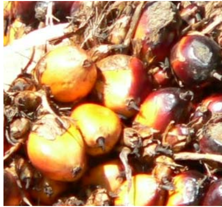
Palm oil fruit

It remains unclear precisely how this new style of governance will ensure that governments are held accountable for their