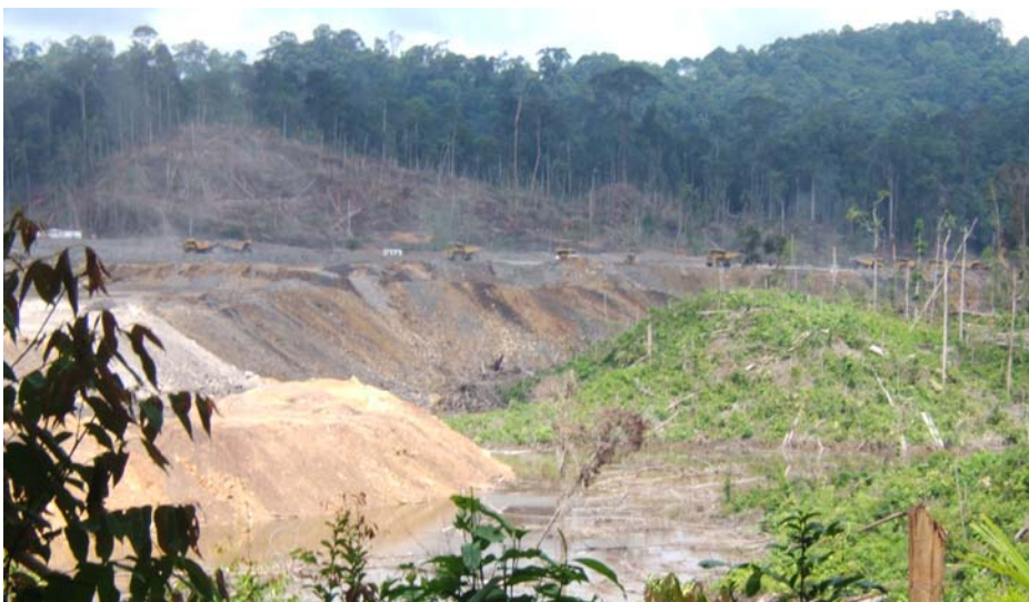
Coal mining destroying forests near Maruwai, Central Kalimantan. ( See video from DTE/WDM visit: https://www.wdm.org.uk/exposed-how-our-banks-finance-climate-change )