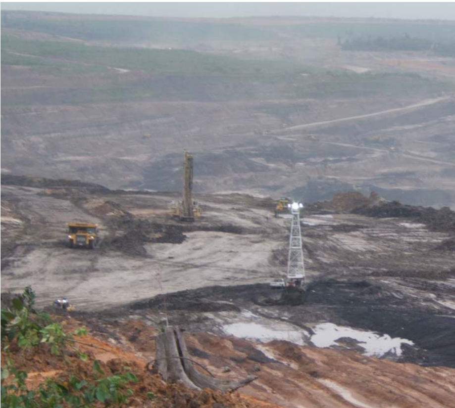
Coal mining as far as the eye can see, KPC / Bumi Resources mine, East Kalimantan: an abandoned stump is all that remains of the rainforest.