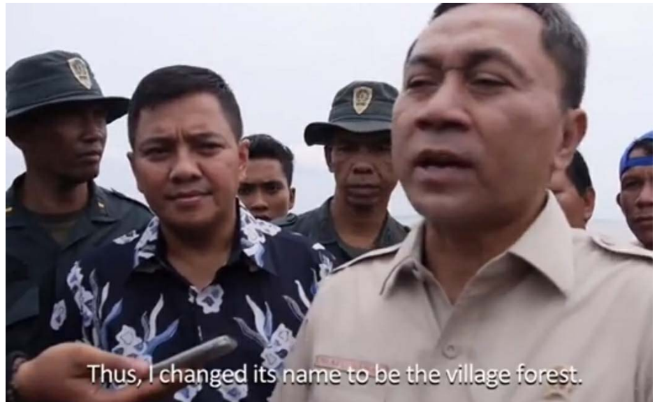
Forestry Minister Zulkifli Hasan interviewed for the HuMa film.

Key Forestry Ministry outputs since MK35/2012 include: