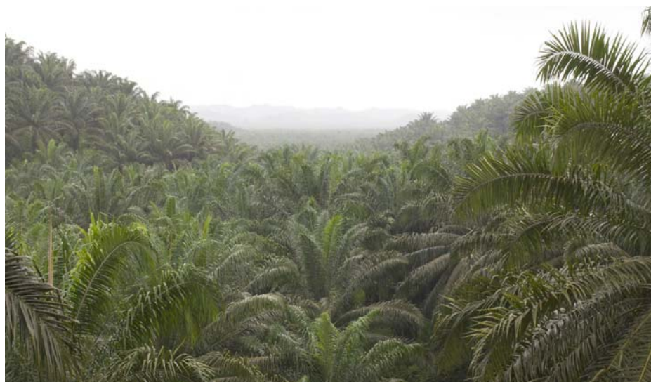
View of the PT Hardaya Inti Plantations oil palm concession in Buol, Central Sulawesi, Indonesia

This expansion is fuelled by growing global demand for cheap vegetable oil for food processing and biofuels. But it's also a result of brutal inequality. The main players in the country's palm oil industry are cronies of former President Soeharto. They are now using their accumulated treasure chests and political connections to grab the lands of the country's most marginalised communities,