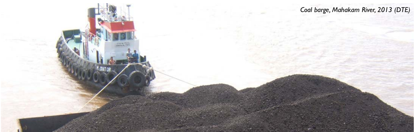
Coal barge, Mahakam River, 2013 (DTE)