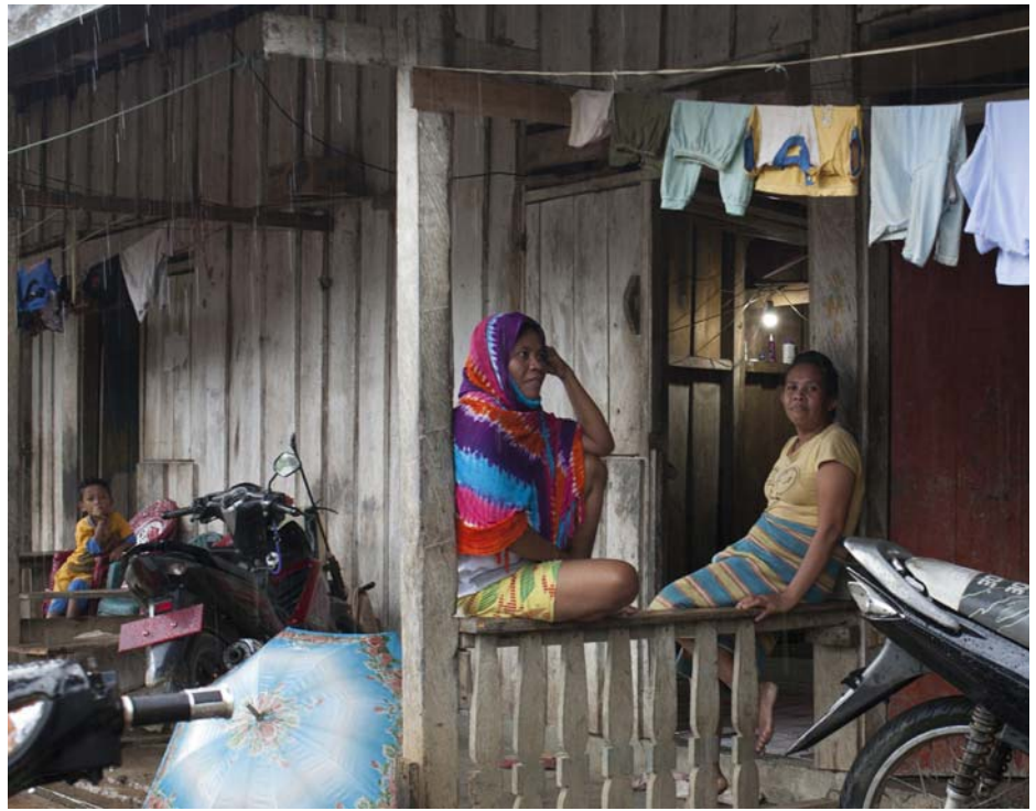
Workers of PT Hardaya Inti Plantations living at the company's worker residence within its plantation, Buol, Central Sulawesi, Indonesia

They also believe that it is crucial for them to have a more detailed map of the area that clarifies land use prior to and after the plantation, and they are looking for support to help finance this work.